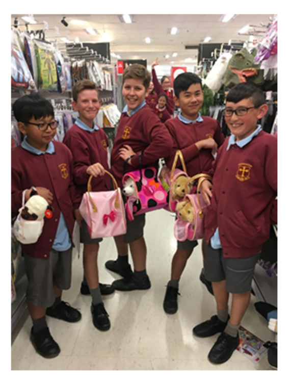
WELL AREN'T WE A GOOD LOOKING GROUP.